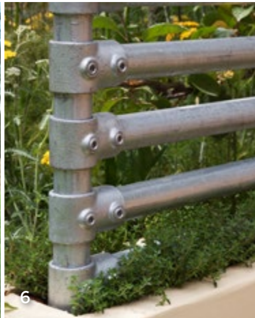
5 MARCUS HARPLUR / GAP PHOTOS / DESIGN: TOM STUART SMITH; 6 ROB WHITTY WORTH / GAP PHOTOS / THE DEPTFORD PROJECT AN URBAN HARVEST GARDEN DESIGNED BY ALEX BELL AT THE RHS HAMPTON COURT FLOWER; 7 ANDREA JONES & XXXXXXXXX

A clever use of scaffolding by Alex Bell at the 2011 RHS Hampton Court Palace Flower Show. It's modern and functional as a fence, plant support, pergola or dividing screen.