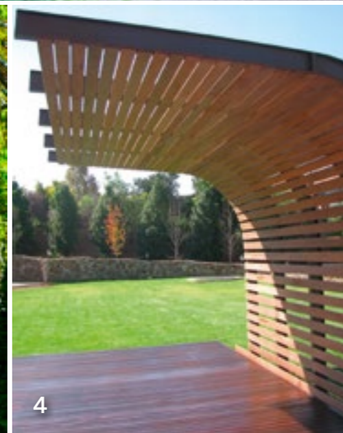
2 HEATHER EDWARDS / GAP PHOTOS; DESIGN: ANDY STURGEON. 3 © ANNA STOWE BOTANICA / ALAMY. 4 XXXXXXXX